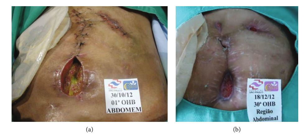
FIGURE 3: Enterocutaneous fistula with active draining at the beginning of hyperbaric oxygen therapy (a). After 30 sessions, closure of the fistula tract was observed (b).

FIGURE 2: Significant healing of perineal fistulizing Crohn's disease wounds observed at the beginning of treatment (10 sessions) after perineal surgery (a) and at the end of 20 sessions (b).