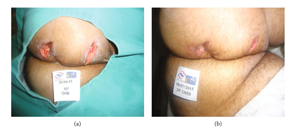
FIGURE 2: Significant healing of perineal fistulizing Crohn's disease wounds observed at the beginning of treatment (10 sessions) after perineal surgery (a) and at the end of 20 sessions (b).

pCD: perineal fistulizing Crohn's disease; ECF: enterocutaneous fistula; PG: pyoderma gangrenosum; CD: Crohn's disease; SD: standard deviation; HBOT: hyperbaric oxygen therapy. *ANOVA test. **Pearson chi-square test.